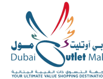
Out Let Mall Dubai