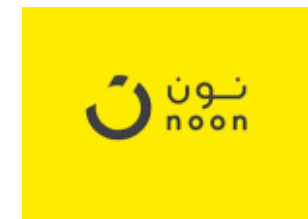
Noon as a client on top